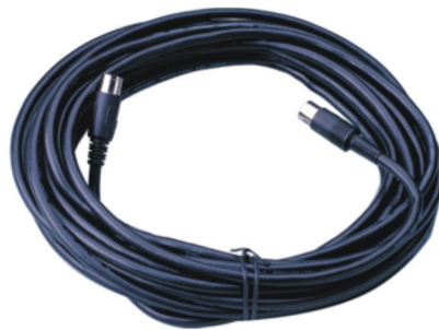
13 pin cable 5M/10M/20M